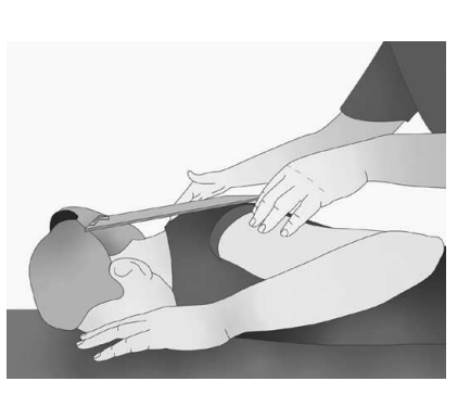
Figure 3. Exercises to improve forward head posture: Horizontal shoulder abduction.