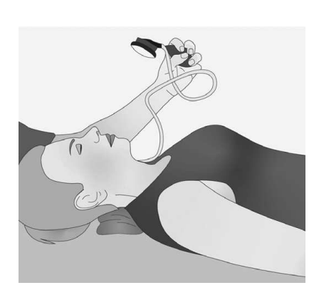
Figure 1. Exercises to improve forward head posture: Neck curl with chin tucked in.

All of the therapeutic exercise programs that have been carried out to date led to short-term improvement of the variables that were examined, in terms of muscle strength and elasticity, posture and FHP.<sup>8,14,28–30,33,35–37</sup> The studies that included evaluation of the effects of the treatment after a more extended period (follow-up), however, concluded that the improvement of the parameters was not maintained with the passage of time. The duration of the follow-up measurements was from one month to four months after the end of the interventions.<sup>15,21</sup>