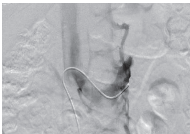
Figure 2. Left renal venous angiography in a 33-year-old female with nutcracker syndrome.

in the literature. In the postoperative period, the aldosterone and renin levels were normal and primary hyperaldosteronism was excluded. This situation was thought to be due to NCS.