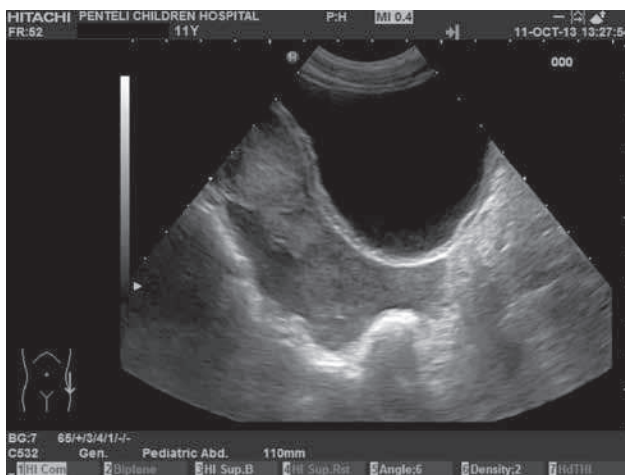
Figure 1. FAST (focused assessment with sonography in trauma) ultrasonography (US) (lower pelvis, sagittal view): Hyperechoic fluid collection, consistent with hemoperitoneum.

The spleen is the most frequently injured abdominal organ.