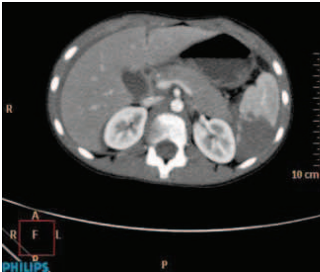
Figure 3. CECT of upper abdomen (axial view): Large portion of splenic parenchyma is hypoperfused; no contrast blush is noticed. Peritoneal fluid collection is observed (perihepatic space, Morrison recess and perisplenic space).

Delayed rupture of spleen may occur up to 10 days after trauma. Current management strives to avoid splenectomy. About 60% of patients with splenic injury do not have associated left lower rib fractures. The American Association for the Surgery of Trauma (AAST) had proposed a splenic CT injury grading scale (5 grades according to size of lacerations, subcapsular or central hematomas, splenic tissue maceration or devascularization), which is of limited clinical value since it does not predict the success rate of conservative management. On the other hand, the contrast extravasation has great impact of the patients' management; in the majority of such cases operative management is needed.