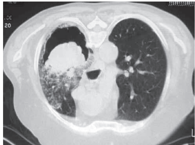
Figure 2. CT scan in the prone position shows that the mass moved within the cavity with the change in position.

1 Department of Computed Tomography, "A. Fleming" General Hospital, Athens, 2 Emergency Department, General Hospital of Chalkida, Chalkida, Greece