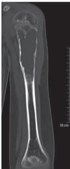
Figure 1. Coronal view of left humerus bone. A solitary, lytic, well-defined lesion is noticed in upper diaphysis. The affected bone is expanded, the cortex is thinned and endosteal scalloping is also observed.

1 Department of Radiology, 2 Orthopedic Clinic, Penteli Children's Hospital, Athens, Greece