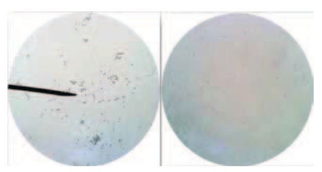
Figure 2. Aggregation patterns of phospholipase A2, acidic 1 precursor. Aggregation of platelet from normal healthy person (×1,000); aggregation pattern of SLE patient (×1,000).

etin receptor (anti-TPOR) antibody responses were more frequent in SLE patients with thrombocythemia than in those without thrombocythemia, but the types of clinical presentation associated with these autoantibodies are different.<sup>13</sup> Among patients with SLE with thrombocytopenia, 60% were shown to have antiplatelet antibodies against GPIIb/IIa, GPIb/IX or GPIV,14 but the glycoprotein GPIIb/ Illa complex is the most abundant platelet receptor.<sup>15</sup> The T. albolabris venom Alboluxin is a potent platelet agonist acting via GPIb and GPV<sup>16</sup> of which anti GPIb/IX continues to be present in SLE. Both Alboluxin and phospholipase A2 acidic 1 precursor can be as a tool for the detection of antibody coated platelet in SLE. The test system is quite simple and the snake venom can be obtained from snake farms. Currently the purified protein can be produced in the research laboratory but nowadays application of the polymerase chain reaction (PCR) can overcome such purification and cloning of the protein may be an alternative. Some drawbacks may be encountered such as a very low platelet count in SLE during thrombocytopenia; it was very difficult to get the level up to 150,000-200,000 cells/µL for the experiment in some cases. As reported above these students with SLE were receiving corticosteroid treatment. In the periods when the disease was in a "silent" phase, they had no rash, normal CBC, normal urinalysis and,