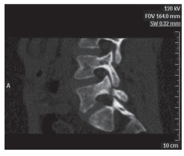
Figure 3. Oblique parasagital view at the level of right pars interarticularis of L3–L5 vertebrae. Defect of right pars at L5 level, with irregular margins.

Figure 2. Oblique parasagital view at the level of left pars interarticularis of L3–L5 vertebrae. Defect of left pars at L5 level, with regular margins.