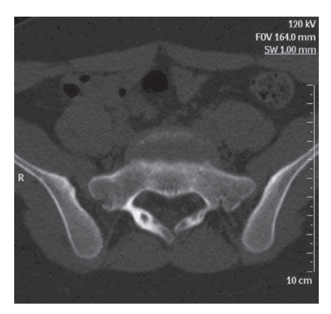
Figure 4. Spina bifida occulta at the level of S1.

trauma rather than a single traumatic event have been suggested to play a role in the development of spondylolysis. Its incidence is about 5% among children (especially adolescent athletes or those with leisure time sport activities) and 6% among the general population. It typically presents with low back pain, usually among youths. Approximately 95% of cases occur at L5 level; rarely it has multilevel involvement. Spondylolysis is more frequently observed in patients with spina bifida occulta, which was also verified in our patient (fig. 4). The morphology of spondylolysis simulates the adjacent facet joints; thus, the first impression when viewing the axial slices of affected spine is that of "too many facets". Facet joints usually have regular cortical defects in contrast to the pars defects.